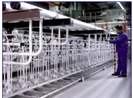
Aluminium pipe system

Aluminium is a base metal that spontaneously oxidizes when it comes into contact with oxygen from the air. Hereby the aluminium is covered with an oxide skin of aluminium oxide. This natural oxide skin can protect the underlying aluminium, under non-burdening conditions, against corrosion. This process of natural oxidation and the formation of a corrosion-protective oxide skin is called passivating.