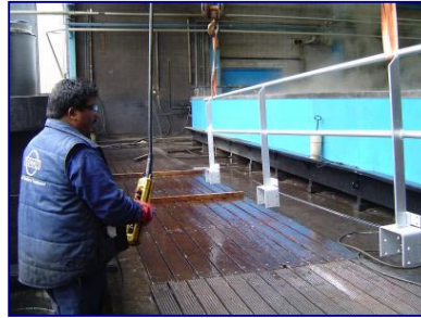
Spray pickling and high-pressure rinsing of aluminium handrails